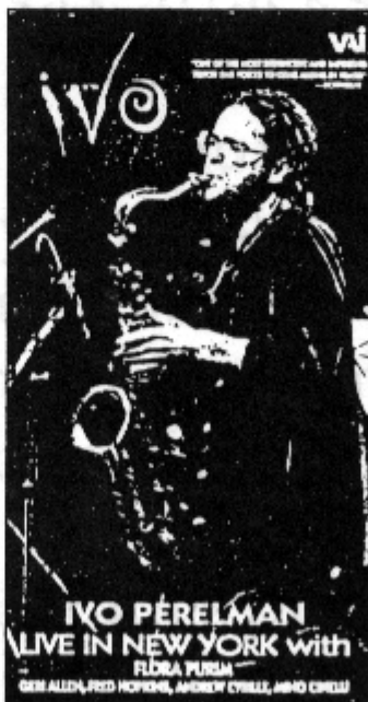
Ivo Perelman LIVE IN NEW YORK VHS, 58:40 minutes