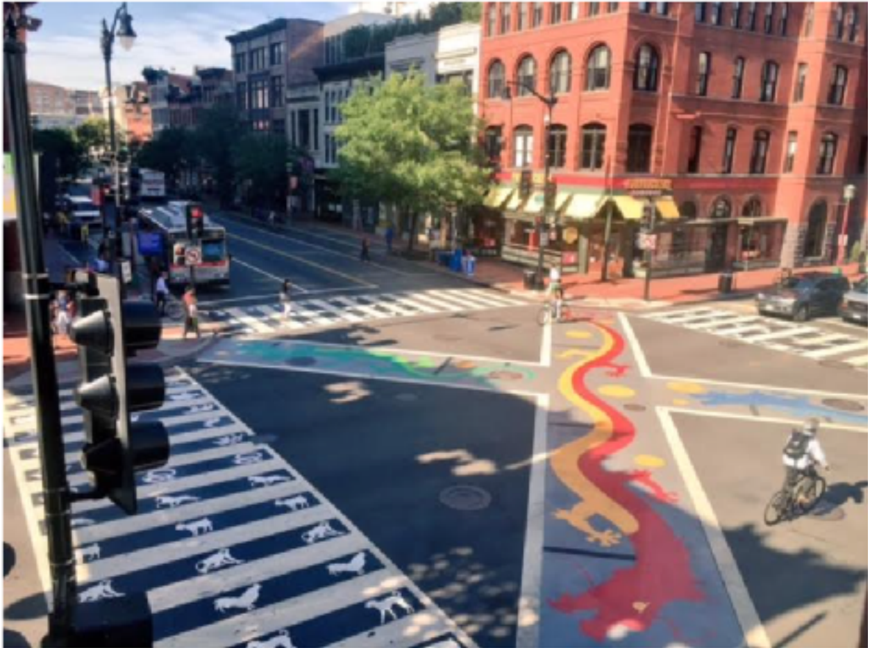
Aerial View of Completed Installation