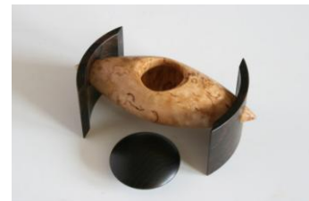
Weissflog's Hidden Box*