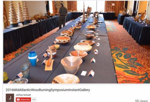
Jeffrey Captures The Instant Gallery