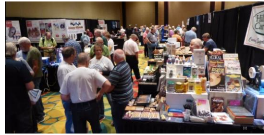
The Trade Show Floor