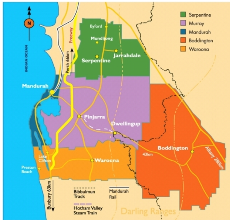
Map courtesy of Peel Development Commission