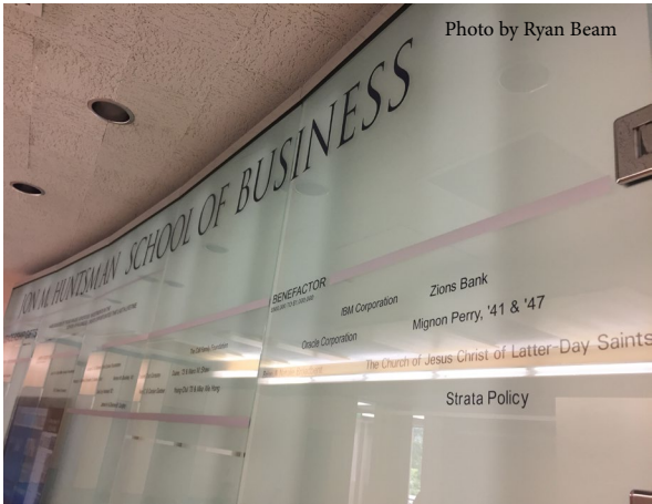
Strata Policy listed as a $500,000 to $1 million donor to the USU Jon M. Huntsman School of Business.