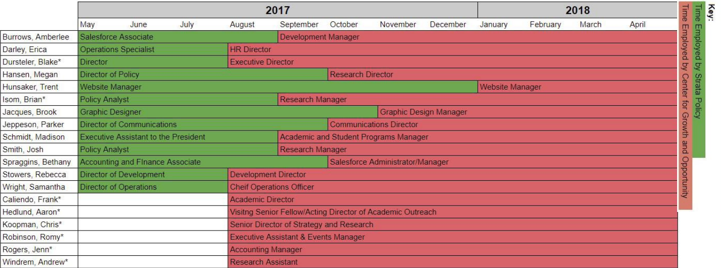
Figure 1: Staff conversions between Strata and the Center for Growth and Opportunity

Overlap between Strata and Utah State has long made it difficult to tell where one institution began and the other ended, raising questions about the university’s relationship to the Koch-funded think tank. Strata’s reports often featured the logos of both Strata and Utah State or had authors from both institutions. Strata press releases said the organization drew from “... the collective academic strength and ideas from the faculty and students at Utah State University.” 16 Funds have also traveled between the two institutions, including a gift of up to $1 million from Strata to the Huntsman School of Business (see photo) and a $19,700 scholarship to Strata from the university. 17