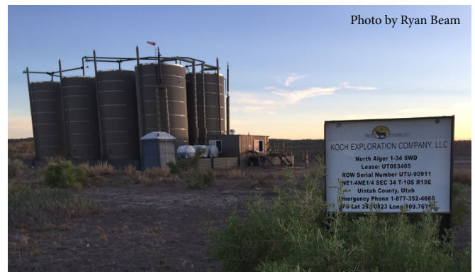
Koch Exploration Company facilities on public lands, Uintah County, Utah.

According to the Climate Investigations Center, between 2009 and June 2018 Koch Exploration Company purchased oil and gas leases on more than 28,000 acres of federal public lands in Montana, Colorado, Wyoming, New Mexico and North Dakota. 9 In Montana, Koch Industries' Matador Cattle Company is listed as the permit holder for more than 128,000 acres of public land managed by the Bureau of Land Management for cattle grazing. 10 The Koch Industries-owned Georgia Pacific, one of the largest forest products companies in the United States, has federal contracts to log trees from national forests. 11