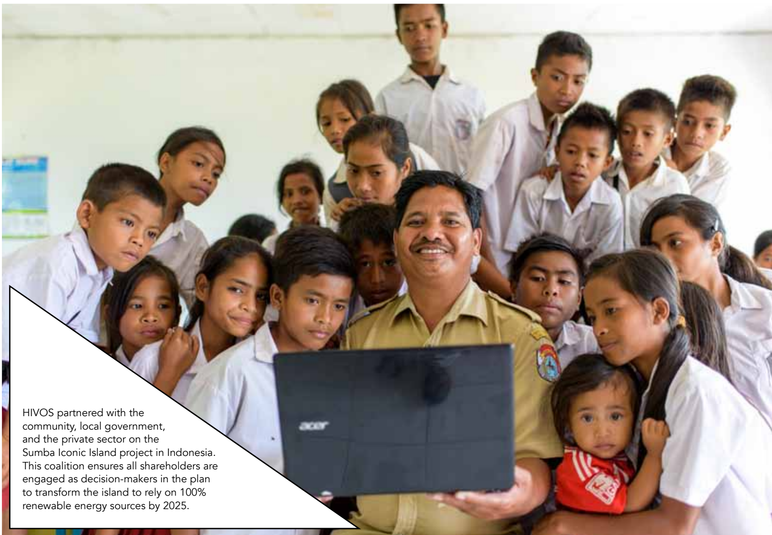
HIVOS partnered with the community, local government, and the private sector on the Sumba Iconic Island project in Indonesia. This coalition ensures all shareholders are engaged as decision-makers in the plan to transform the island to rely on 100% renewable energy sources by 2025.

Hivos and their partners are changing minds on the street and in the legislature with their policy work. Through various education initiatives, they're helping the media and local CSOs be better informed. Examples like the Sumba Iconic Island Project illustrate that renewable energy isn't tomorrow's dream but today's reality.