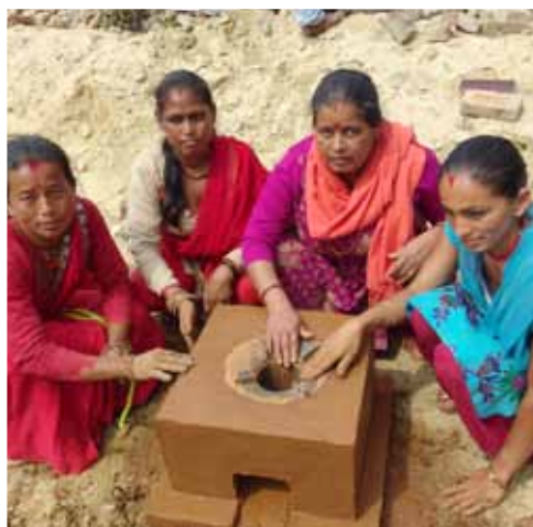
Above: The CRT/N WE program in Nepal connects newly trained, improved cookstove entrepreneurs with manufacturers who can supply them directly with products. It is hoped that these connections will help create an established supply chain for ICS technology.

Multiple projects around the world are putting technological advances to the test. In Indonesia, as part of the Sumba Iconic Island Project, Hivos is converting a remote, off-grid island to 100% reliance on renewable energy sources. In Nepal, CRT/N's work with improved cooking stoves (ICS) is creating a market for sustainable energy products.