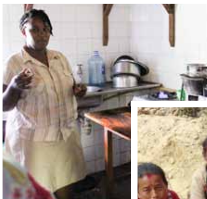
Above: Distrust of biogas technology has led to a lack of adoption. KEBS & HIVOS hope that establishing biogas standards will help increase customer trust and fuel an uptick in the use of biogas products.

Multiple projects around the world are putting technological advances to the test. In Indonesia, as part of the Sumba Iconic Island Project, Hivos is converting a remote, off-grid island to 100% reliance on renewable energy sources. In Nepal, CRT/N's work with improved cooking stoves (ICS) is creating a market for sustainable energy products.