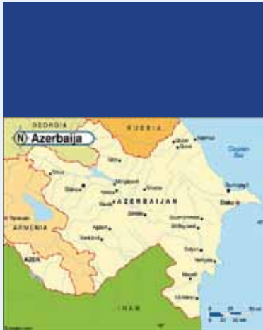
Azerbaijan - Country Map

Program for Spring Quarter 2011 Chair and Program Organizer: Ilse Cirtautas Near Eastern Languages & Civilization email: icirt@u.washington.edu