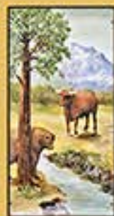
Near 366 Main St. "Stock Market Allegories" By Julia Swain Auction Lot #: 2