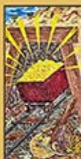
Near 263 Main St. (left) "Eureka!" By Charlie Basham Auction Lot #: 19