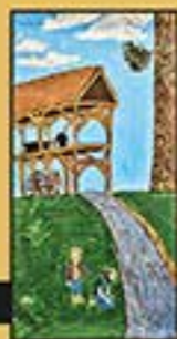
Near 524 Main St. "Where the World Rushed In" By Sarah Fridrich Auction Lot #: 7