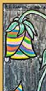
Lot Near 601 Main St. "Is it Enough?" By Annie Boyd Auction Lot #: 9