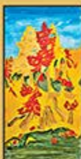
Near 541 Main St. "Gold Country: In the Abstract" By Donna Ericson Auction Lot #: 14