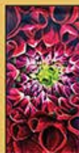
Near 482 Main St. "Hidden Gold" By Jamie Cola-Bersamina Honorable Mention Auction Lot #: 4