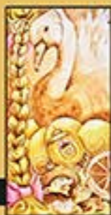
Near 423 Main St. "Fairytales of Gold" By Donna Bohlin Honorable Mention - Auction Lot #: 17