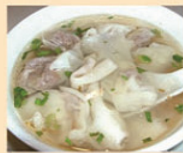
3 長江餛飩 £7.50 Pork Changjiang won-ton in soup