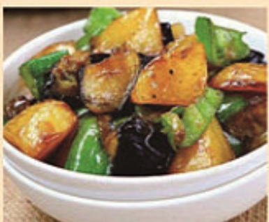
19 幹燒地三鮮 £9.00 Sliced pork with pumpkin, potato & runner beans