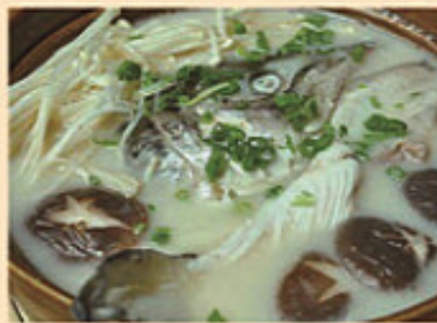
2 魚頭豆腐湯 £14.00 Fish head & tofu soup