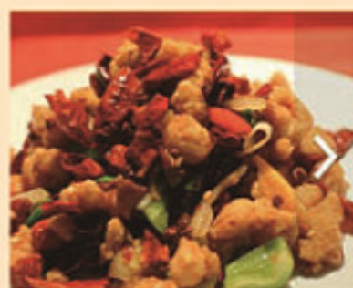
16 樂山辣子雞 £10.00 Shredded chicken with chilli & garlic