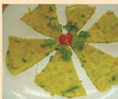
20 南瓜素菜烙 £9.00 Fried shredded pumpkin cake