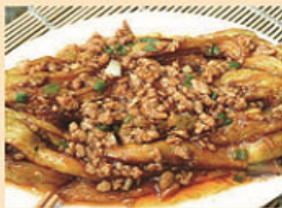
7 佛手茄子 £9.00 Steamed aubergine with garlic and soy dressing (allow 30 mins)