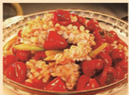
15 川香鮮魷 £12.00 Sliced squid in spicy soup