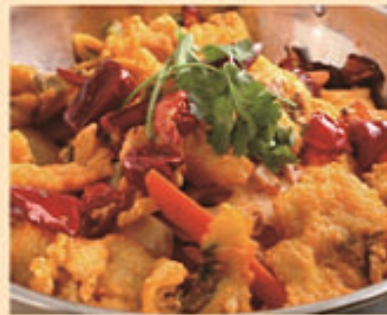
13 幹鍋魚 £10.50 Aromatic baked spicy fish slices (dry)