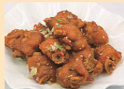
10 椒鹽豬手 £10.00 Salt and pepper pig's trotters