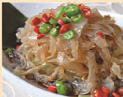
5 醋椒海蜇 £12.00 Shredded jellyfish in spicy vinegar