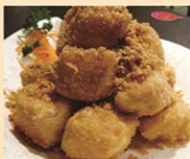
17 避風塘豆腐 £9.00 “Typhoon shelter tofu” (crispy fried tofu covered with toasted garlic & chilli)