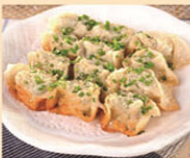
4 煎餛飩 £7.50 Pan fried won-ton with pork filling