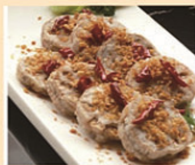
18 避風塘藕夾 £10.00 “Typhoon shelter lotus root” (stuffed with pork, with toasted garlic & chilli)