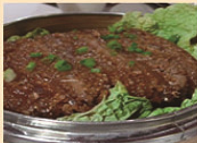
9 芋香粉蒸肉 £14.00 Steamed belly pork coated in finely ground rice with taro