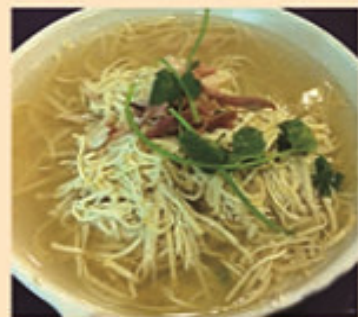
6 揚州煮幹絲 £9.00 Tofu noodles with shredded ham in broth