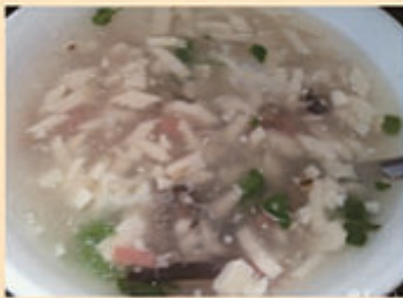
1 平橋豆腐羹 £4.50 Ping Qiao" tofu soup with fish & coriander