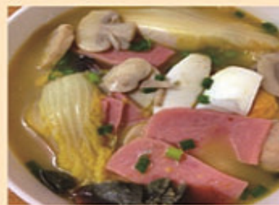
8 上湯白菜心 £9.00 Chinese cabbage hearts with ham, in broth