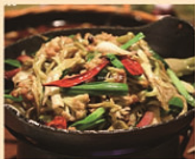
11 幹鍋菜花 £8.00 Aromatic baked spicy cauliflower with Chinese sausage (dry)