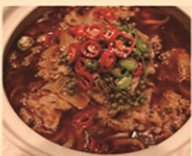
14 川香肥牛 £12.00 Wafer sliced beef in spicy soup