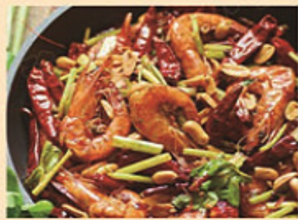
12 幹鍋蝦 £12.00 Aromatic baked spicy prawns (dry)