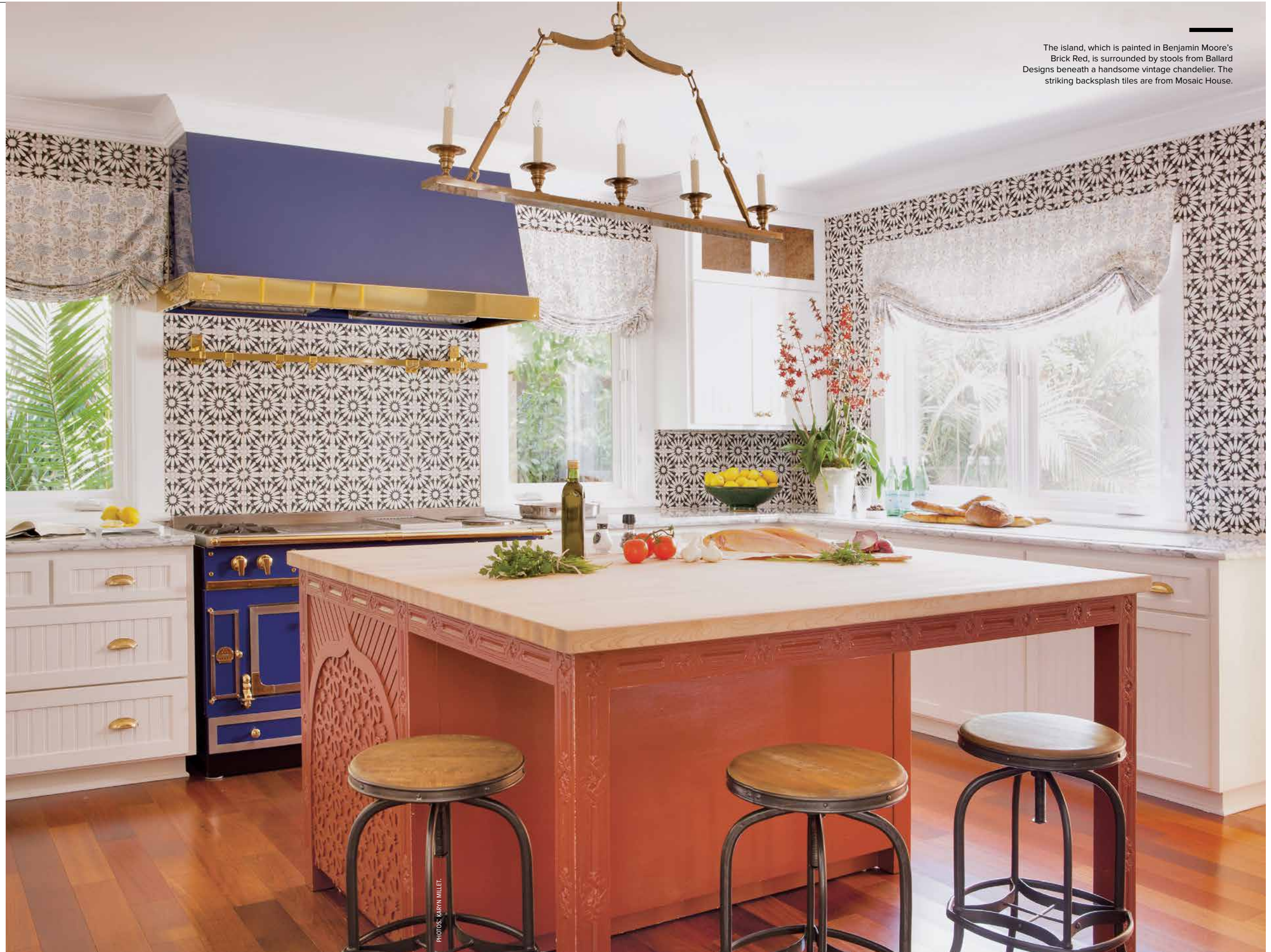
The island, which is painted in Benjamin Moore's Brick Red, is surrounded by stools from Ballard Designs beneath a handsome vintage chandelier. The striking backsplash tiles are from Mosaic House.

Color is a great addition to everyday life. White is classic and timeless, of course, but it is also a very safe option. This kitchen is a bit of a hybrid of pattern and color, and I think it is so much more interesting as a result. Plus, as more spaces are open-plan these days, embracing a little more color in kitchens allows you to connect rooms more cohesively.