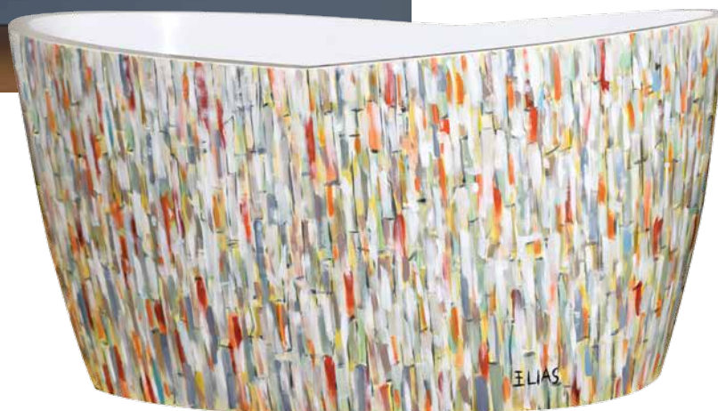
WASH UP PHOTO: COURTESY DURAVIT; EVERYDAY ART PHOTO: COURTESY GROUPWORK; MAKE A SPLASH PHOTO: COURTESY AQUABASS.

Not content to let pristine porcelain tubs lie, the creative team at Aquabass recently released its Kanvas collection of highly artistic freestanding tubs, each hand-painted and signed by the artist responsible for the striking scenes depicted on their glossy white finishes. From cool graffiti patterns to multicolor mosaic-inspired prints, the limited-edition series promises you'll have a lot more to soak in than bubbles during bath time. aquabass.com