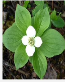
Bunchberry/ Cornus Canadensis