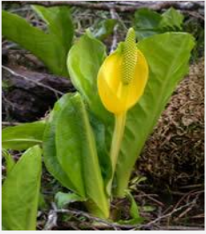
Skunk Cabbage/ Lysichiton Camtschatcense