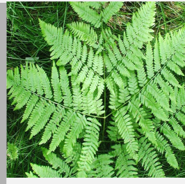
Bracken Fern/ Pteridium Aquilinum

Please refer to our Cormorant Island Visitor Services & Attractions Map for a detailed trail map. Available online or at the Visitor Centre.