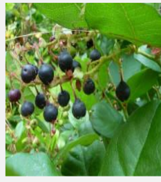
Salal/ Gaultheria Shallon