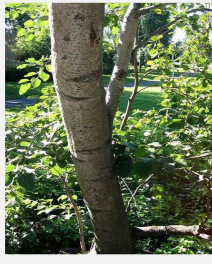
Red Alder/ Alnus Rubra