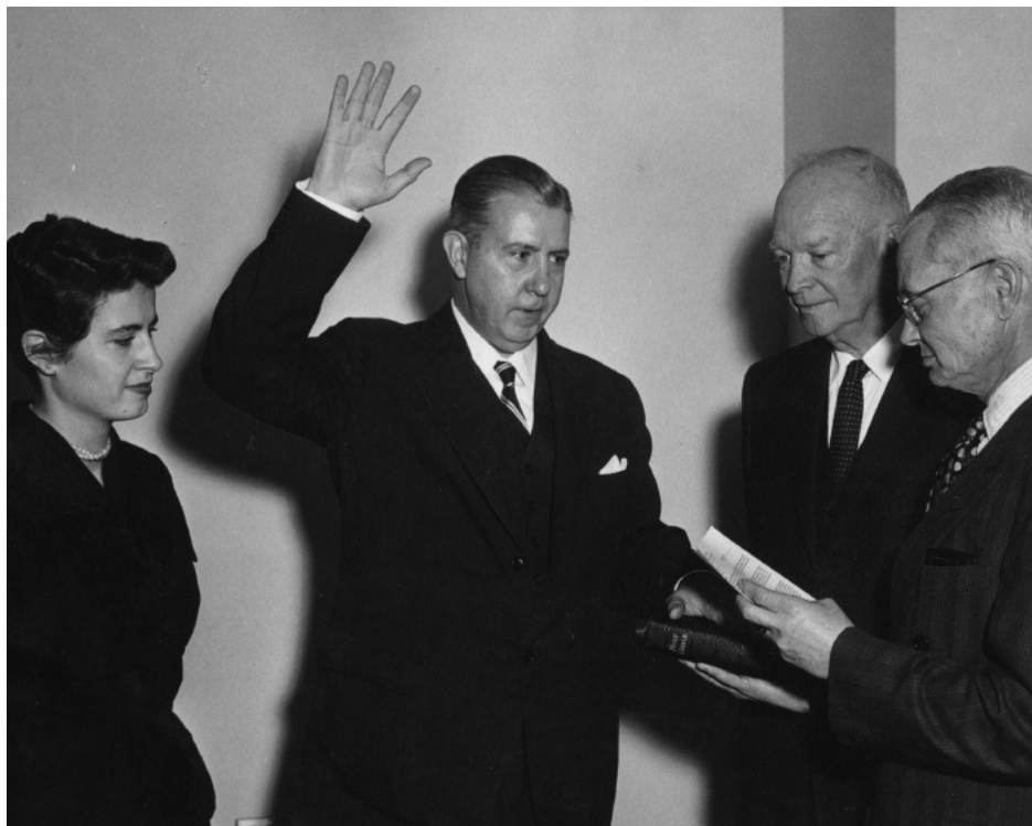
James R. Killian, being sworn in here as special assistant to the President for science and technology, was a key adviser to the President on organizing and developing U.S. intelligence capabilities to warn of a possible Soviet surprise attack.

Meanwhile, in 1956, U-2 aircraft began flying over the Soviet Union. Unlike the SENSINT program, the U-2 program was directed by the CIA, a civilian agency, and piloted by civilians. Eisenhower, while realizing the provocative nature of military aircraft flown by military personnel over or around the Soviet Union, continued throughout his administration to approve