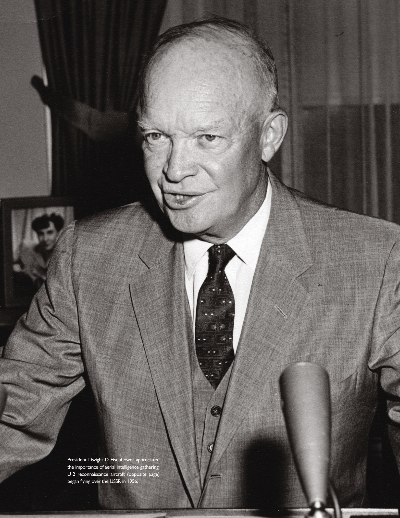
President Dwight D. Eisenhower appreciated the importance of aerial intelligence gathering. U 2 reconnaissance aircraft (opposite page) began flying over the USSR in 1956.