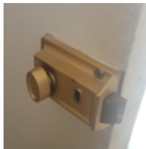
Door interior w/ lock mounted