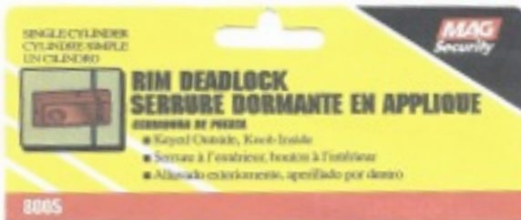
MAG Security Brand- Lock # 8005 or 8006