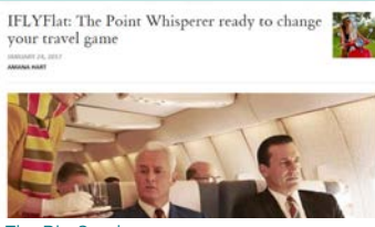
The Big Smoke