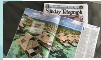
Sunday Telegraph - Escape