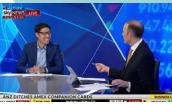
Sky News Business (Live)