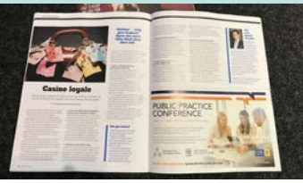
CPA In The Black