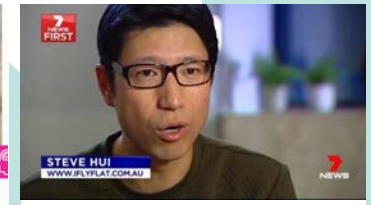
7 News Sydney