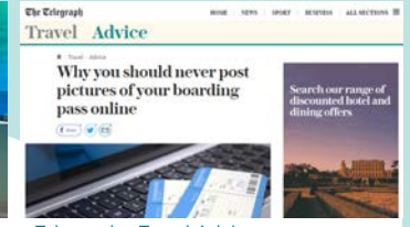
Telegraph - Travel Advice