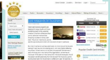
Canstar - Rewards in Business