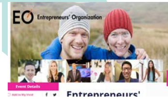
Entrepreneur's Organization Panel Speaker