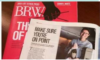
BRW "Ready for takeoff"