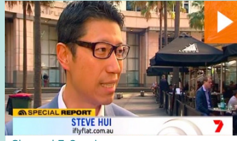
Channel 7, Sunrise