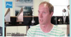
Jules Hall, The Hallway