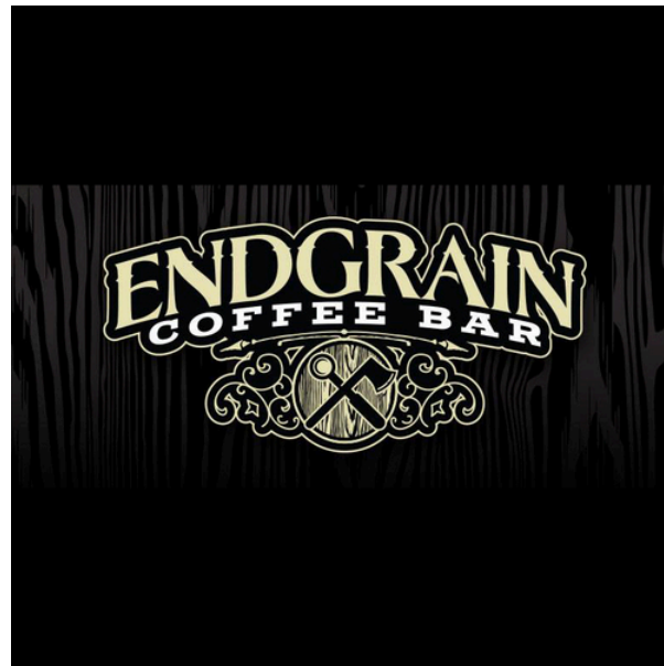
P/B EndGrain Coffee Bar, Pitman NJ

Supercross Cup is fueled by the Endgrain Coffee Bar in Pitman NJ, Visit them online at http://endgraincoffee.com