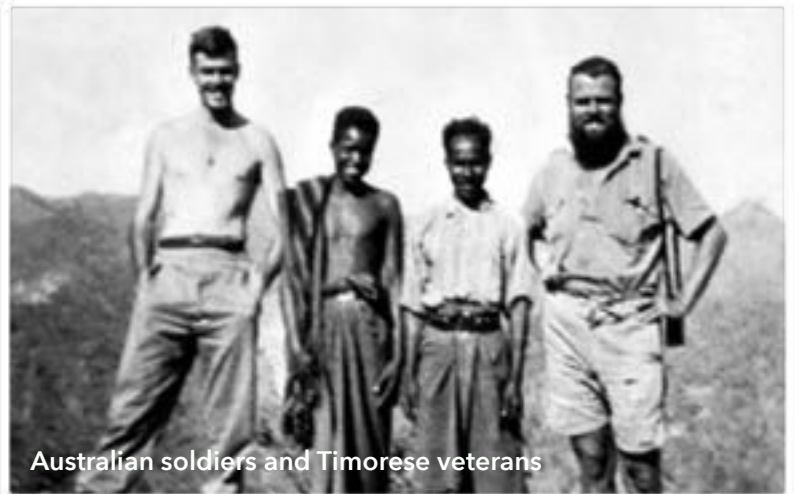
Australian soldiers and Timorese veterans

The Timorese proved firm friends to the 700 Australian soldiers on Timor in 1942. They guided and fed them and saved many soldiers' lives. Over 40,000 Timorese died because of their friendship towards Australians, through Japanese reprisals and Allied bombing.