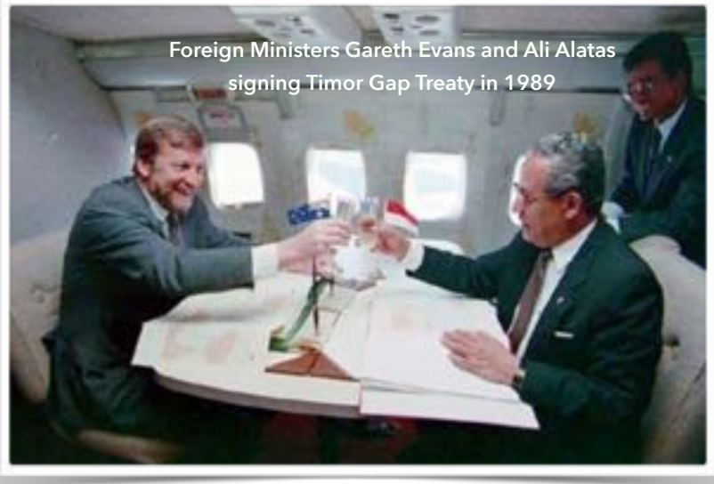
Foreign Ministers Gareth Evans and Ali Alatas signing Timor Gap Treaty in 1989

It would strengthen security and give certainty regarding investment. It would uphold the rights of nations to a defined and internationally accepted sovereignty.