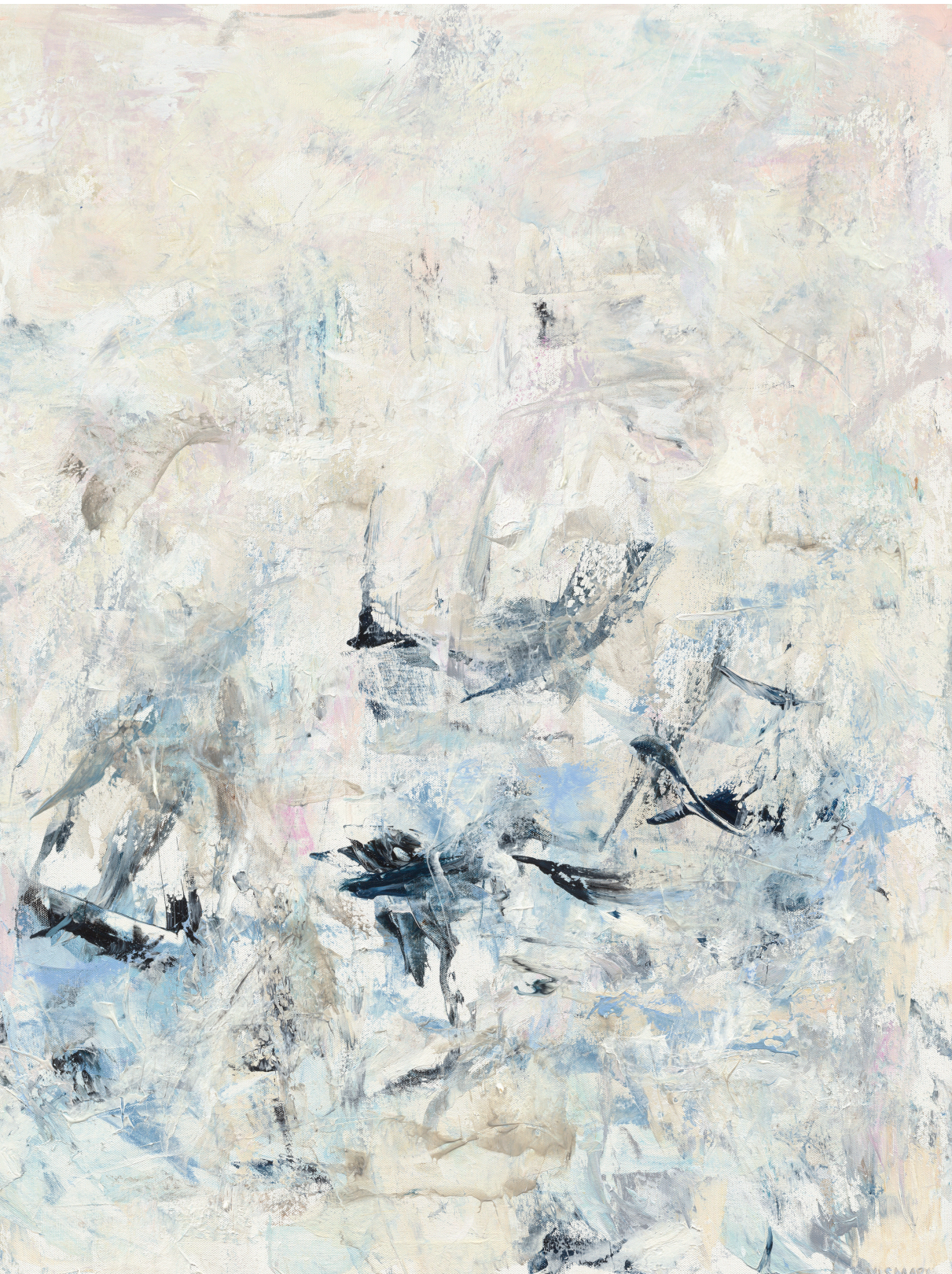
NIKKI VISMARA Murmuration Acrylic on canvas, 60 x 36 in. $4,000

Available at Barba Contemporary Art 191 S. Indian Canyon Palm Springs, CA 92262 (760) 656-8688 michael@barbagallery.com BarbaContemporaryArt.com