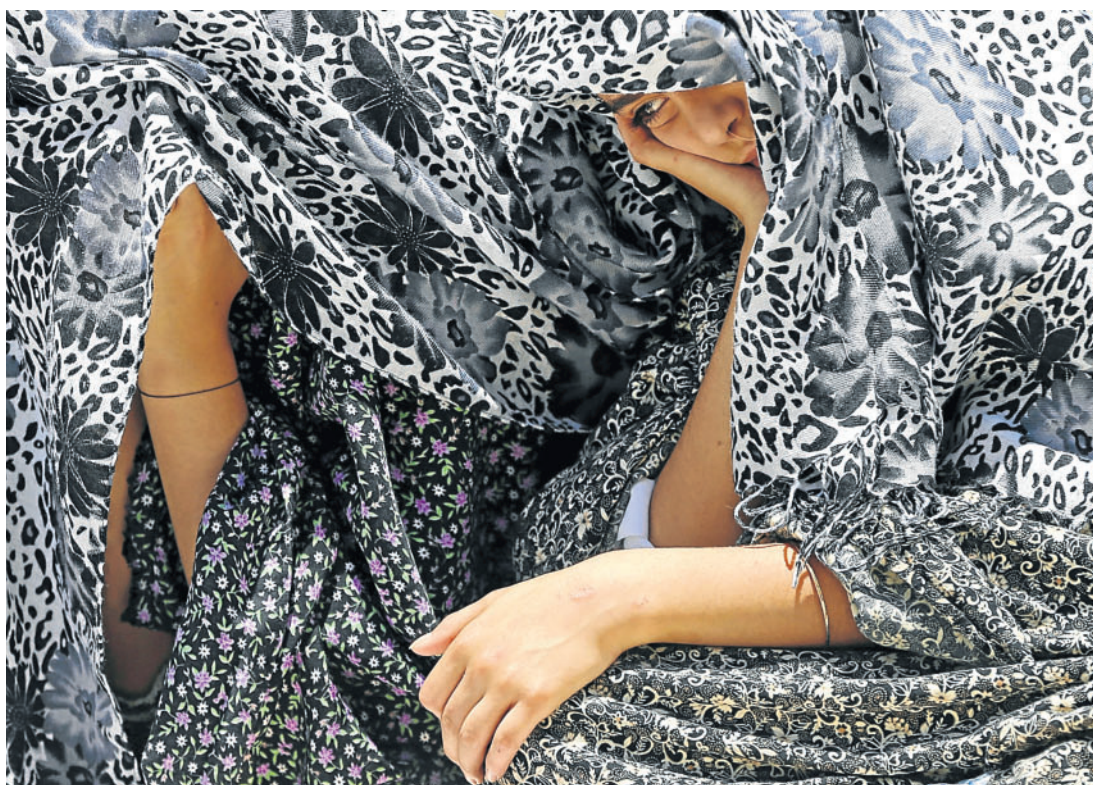
Palestinian girls wait ahead of prayers on the third Friday of the holy month of Ramadan at the compound known to Muslims as the Noble Sanctuary and to Jews as Temple Mount, in Jerusalem's Old City. Israeli police said some 150 000 people attended the prayers at the compound. Israel barred Palestinian men under 50 and women under 30 from entering Jerusalem from the West Bank without a permit