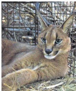
WE'RE ON YOUR TAIL: Jasper, left, photographed by Laurel Serieys of the Urban Caracal Project. The Rooikat was fitted with a radio collar so that Serieys, right, can track him

When he was picked up in the wild, weighing 13kg, Laduma was considered a healthy adult male, although facial scarring suggested he had "been around the block". "According to data collected, we