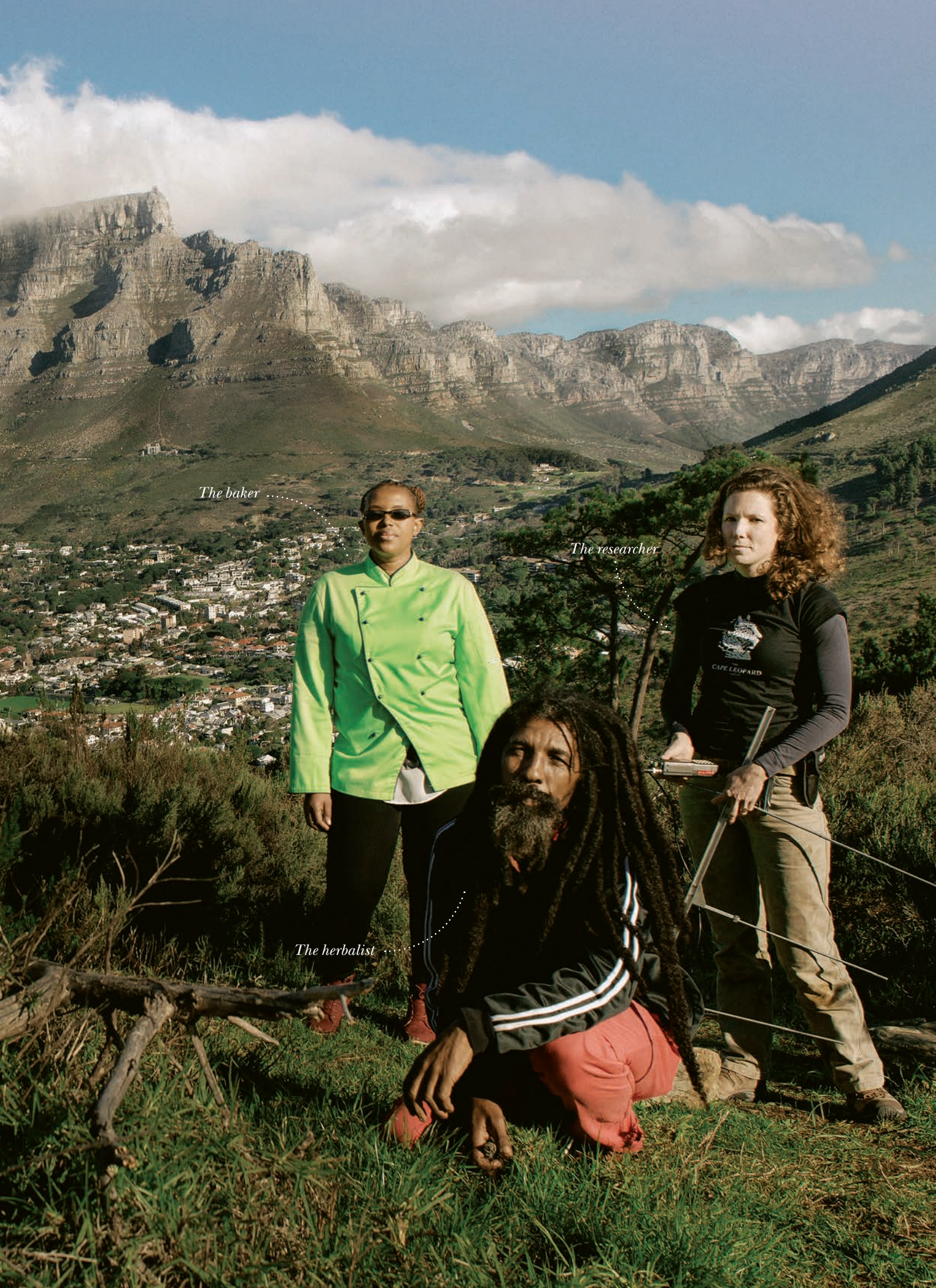
The baker .....