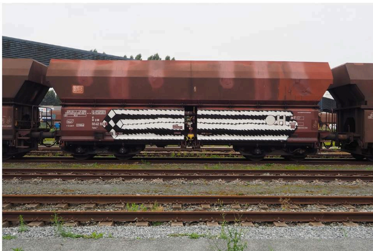
Boris Tellegen aka Delta, train painting

Studio works are displayed, along with graffiti archives, a video game and artefacts of all kinds of collaborations with architects, a music label, and even brands of trainers, clothes, speakers, tiles, etc. This constellation of experiences underscores the artist's need to extend the creative field and reach out to different communities.