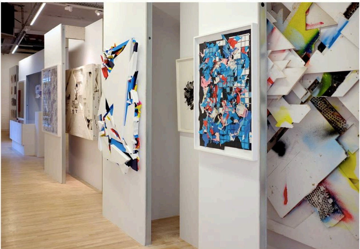
Boris Tellegen: A Friendly Takeover, installation view at MIMA, Brussels, 2017

For this new MIMA exhibition dedicated to Tellegen, the various sculptures/installations spread over three floors, do not offer a chronological narrative of the work, but rather an impressionistic portrait. The works scattered through the installation are associated freely.