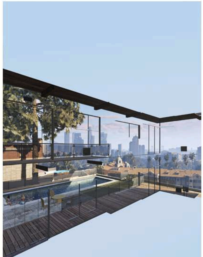
Left: Boris Tellegen – Interburden / Right: Raphael Brunk – Capture 55326.4_19