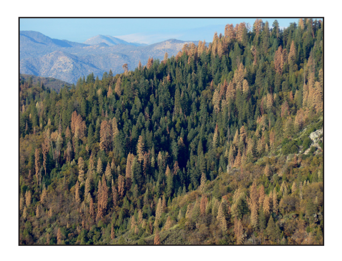
Figure 2. Drought-related tree mortality at a low elevation forest in Sequoia National Park.

There are a number of unburned FMH plots, established as unburned reference sites or prior to a prescribed fire that then did not occur. A major difference between these monitoring