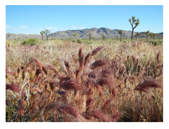
Red brome and cheatgrass non-native grass fuels in Joshua Tree National Park (photo by S.R. Abella, 2017).

Recognizing the risks posed by non-native plant invasions, interest in developing invasive plant management plans has been increasing. Between 2005 and July 2018, the National Park Service performed environmental assessments and impact statements for invasive plant management