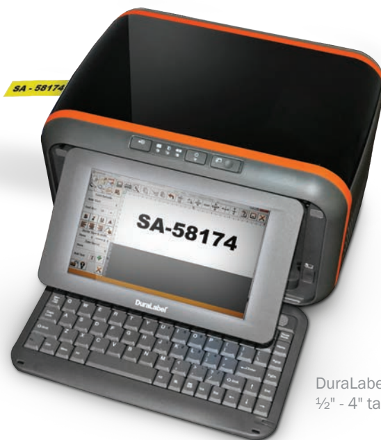
DuraLabel Toro 1/2" - 4" tape widths

Have questions about wire marking or supplies? Call our experts! 888.637.3893