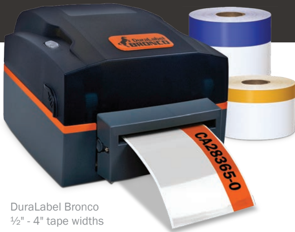
DuraLabel Bronco ½" - 4" tape widths

Print your own wire wraps & shrink tube with DuraLabel printers & supplies