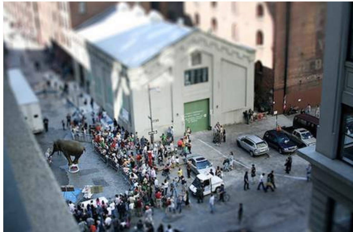
(Don't look for the elephant....)

"Galapagos Art Space is the mother of all performance spaces" - New York Magazine