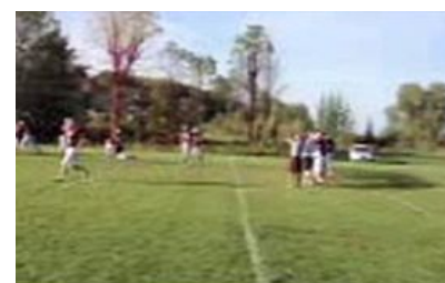
Wallace reinstated as Okemos football coach Sep. 30, 2013