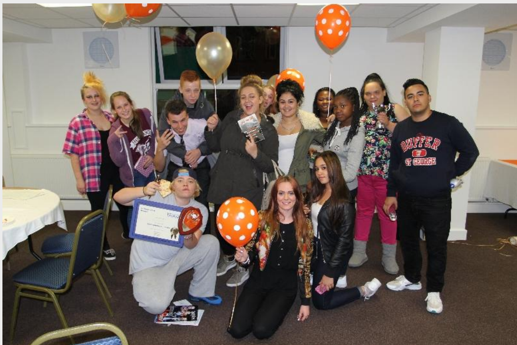
Our first open A.G.M celebration

The event provided a unique opportunity for all our constituents to meet and share their passion for Prospex.