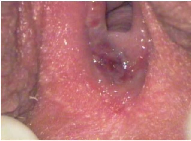
Figure 3. Contusion to hymen after consensual intercourse.

Lower vaginal injuries were more common in self-described virgins evaluated after CSI or NCSI. Hymenal trauma is a frequent part of first intercourse. Hymenal injuries (which include tears, abrasions, ecchymosis, edema, and erythema) tend to be posterior (63% being between the 5 o'clock and 7 o'clock positions) and to cause only minor bleeding and pain. 22 More violent coitus, such as that seen during rape, may produce extension of hymenal lacerations into the vaginal walls or the perineal body and rectum, which can sometimes be accompanied by significant hemorrhage. 19