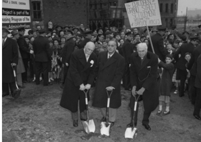
Legendary Power Broker Robert Moses breaking ground on Bruch House