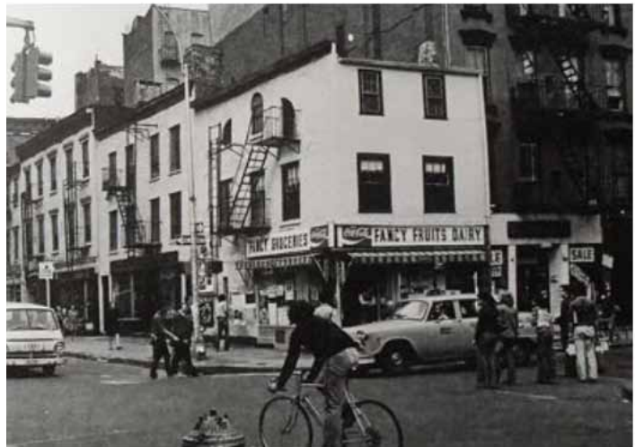
A New York street scene from the era of The Death and Life of Great American Cities