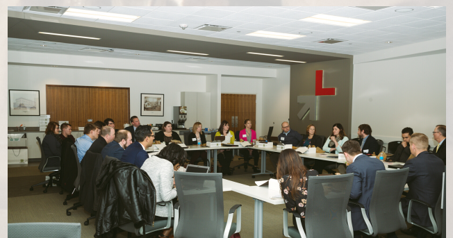
Luncheon with young professional groups to crowdsource ideas