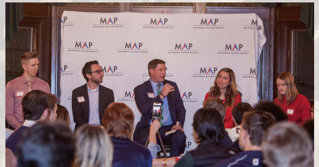
Red and Blue Dialogue