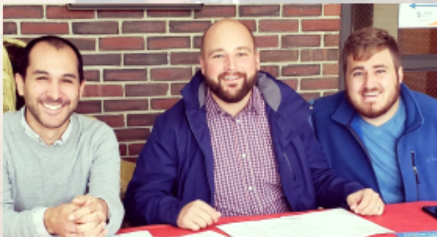
Voter registration drive