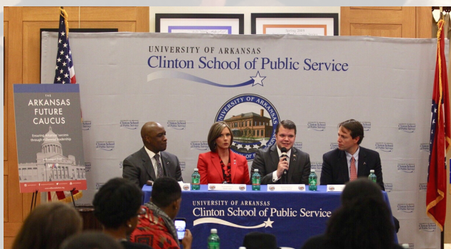
Issue-focused panel discussion with expert organizations