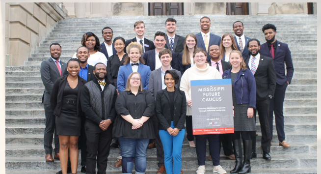
Day-long Millennial policy summit at the statehouse