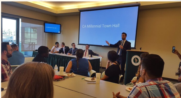
Reverse town-hall with local community members

MAP is available to co-host engagement events with the caucus. Community activities should be organized to guide the caucus in issue awareness and amplify the caucus' presence in the community. Some examples include: