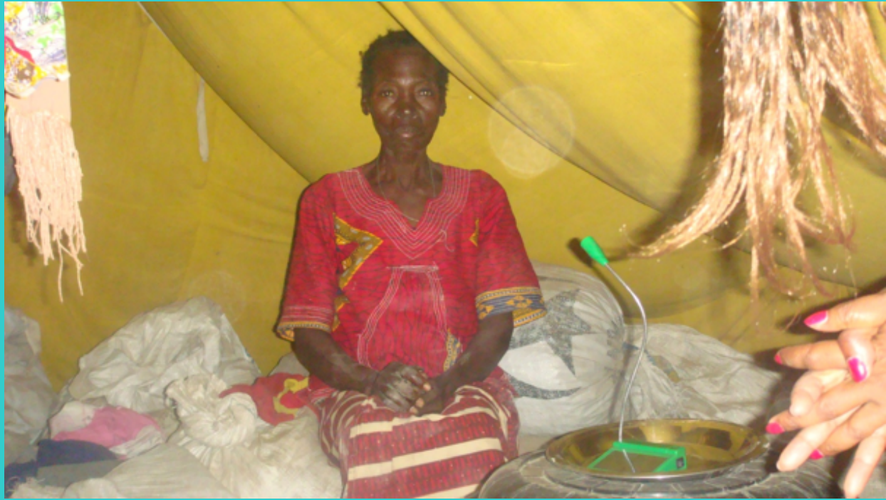
Unite to Lite lamp in use in Beom camp, 1/13

$8,700 worth of antibiotics, medicines and medical supplies, left Santa Barbara by air on February 20. In all three cases our partners provide the materials without cost to CRF. Through these arrangements CRF has been able to multiply its assistance to the CAR refugees.