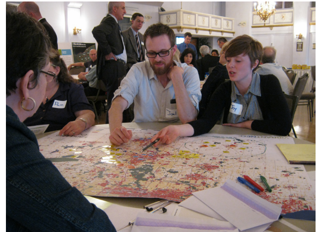
Regional workshop participants providing scenario input