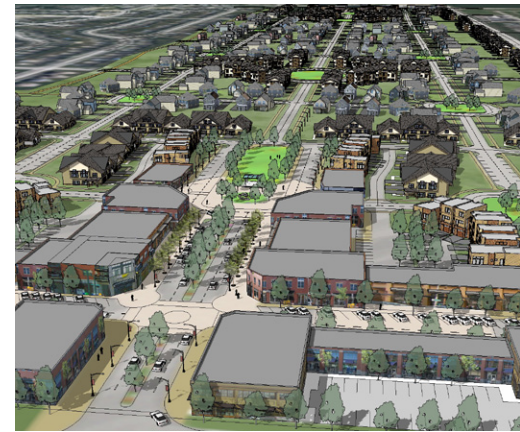
The concept includes walkable mixed-use development along Route 126 in Plainfield.