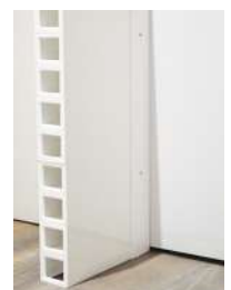
L-Shaped Channel 4ft