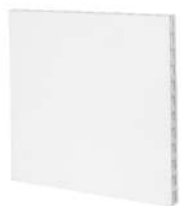
EverPanel 3ft x 3ft