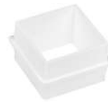
EverPanel Lug Connector