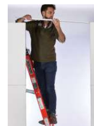
Door Lintel (Narrow)