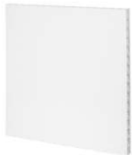
EverPanel 4ft x 4ft