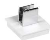
EverPanel Mounting Cap