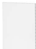
EverPanel 3ft x 4ft