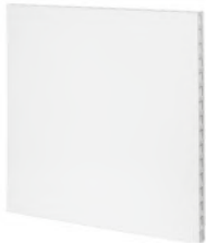
EverPanel 4ft x 4ft