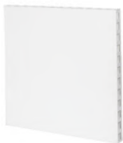
EverPanel 3ft x 3ft