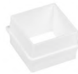
EverPanel Lug Connector