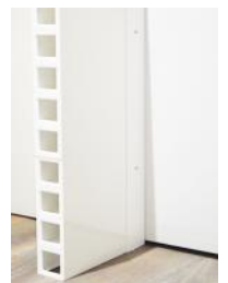
L-Shaped Channel 4ft