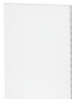
EverPanel 4ft x 3ft