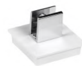
EverPanel Mounting Cap