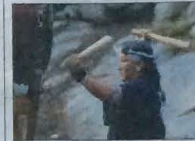
TRAILS AND VISTAS