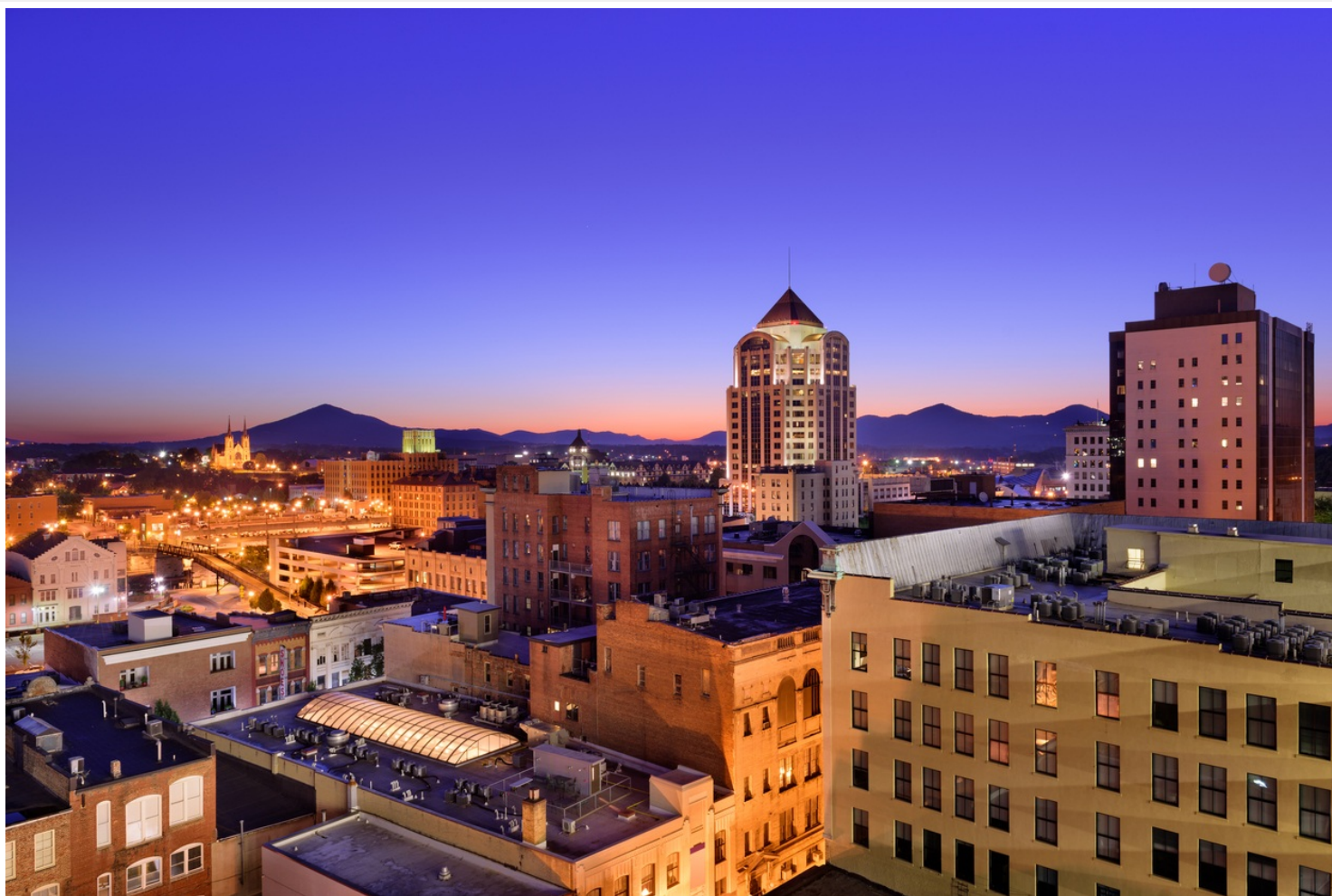
Roanoke, Va., came in at No. 1 on the GoodCall list of Best Cities for New Grads.

💬 NO COMMENTS YET ( HTTPS://WWW.GOODCALL.COM/DATA-CENTER/2017-BEST-CITIES-NEW-GRADS/#RESPOND )