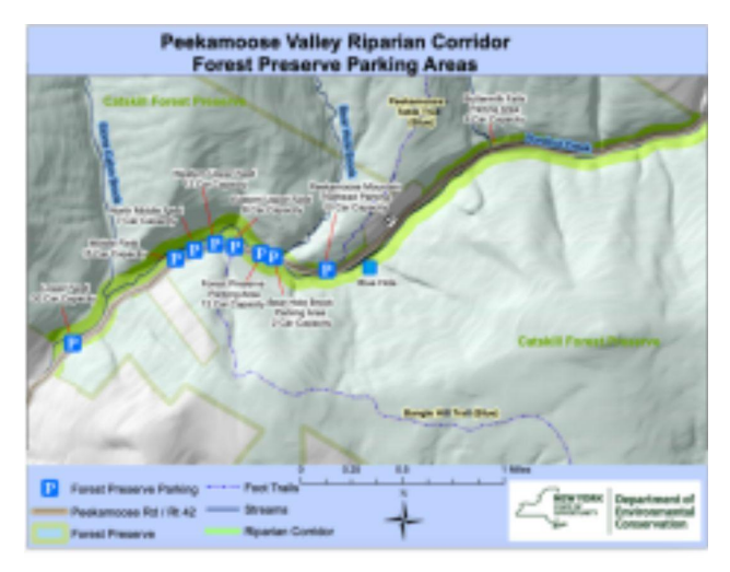
Permit expansion includes all access to the Peekamoose Valley Riparian Corridor. Permit season dates: May 15th - September 15th

Peekamoose Blue Hole In 2022, the permit system, which was expanded in 2021 to seven days a week during peak season and covered additional locations. including the entire Peekamoose Valley Riparian Corridor, was once again in place. Popular sites in the corridor include the Blue Hole. Buttermilk Falls, Peekamoose/Table Mountains Trailhead, Bangle Hill Trailhead, Upper Field, Middle Field, and Lower Field. The permit expansion was an effort to include all camping in the Peekamoose Valley. Campers received a permit that is good for the entirety of their stay, at their specific campsite.