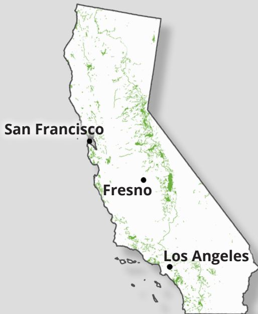
Human-Powered Recreation Resources

California has 4 MILLION ACRES of human-powered recreation resources. 66% of them are on national public land.