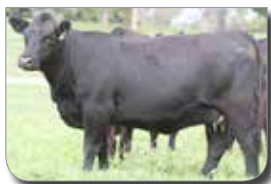
Two year old Emperor daughters at Millah Murrh Angus, Bathurst NSW.