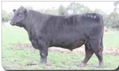
Emperor at 2 years.