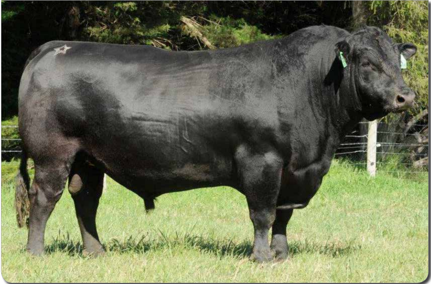
Owned by Murdeduke and ABS Australia