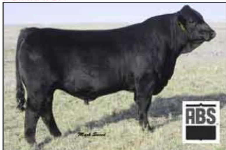
ELLINGSON DOMINATOR W905 ASA 2510801PB SM