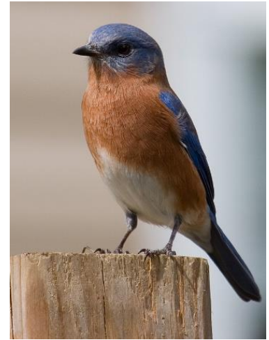
Eastern Bluebird - Missouri State Bird