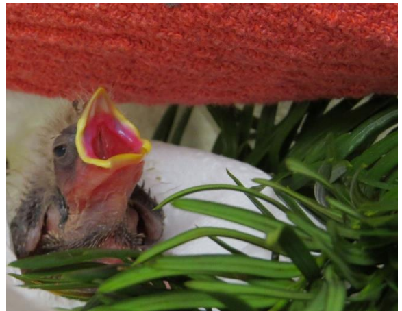
A House Finch who was snatched from the nest by a predator; the parents went on the attack but the rescuer could not locate the original nest.

Wild animal care requires very specific skills and knowledge and WBR is licensed by state and federal entities. We have seen many situations where birds have not been able to recover from the treatment they were given based on recommendations from an internet search or a desire to adopt the bird as a family pet. If possible, please contact us before giving any food or treatment.