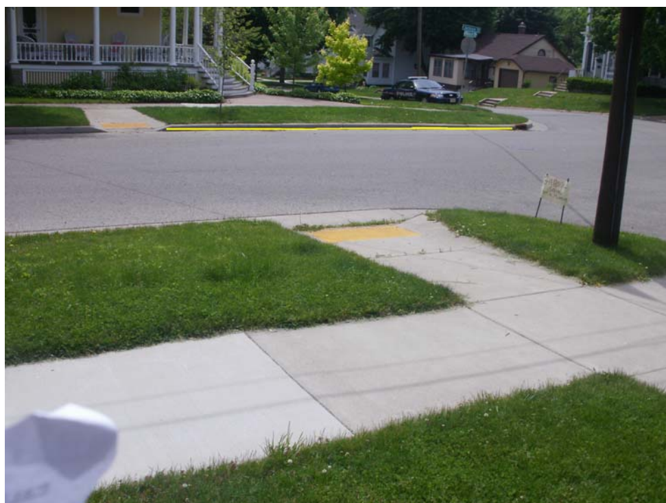
Looking Southwest across offset intersection of Jackson & N Monroe Streets (yellow added)