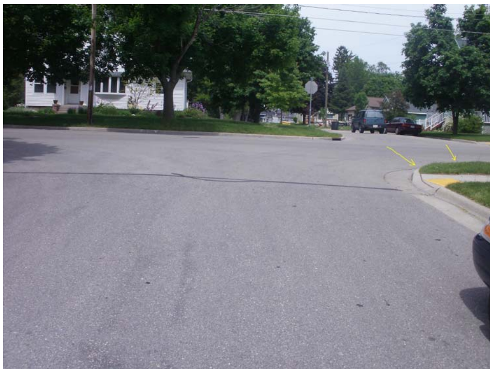
N Monroe Street facing north toward Jackson Street – yellow arrows on right show concern