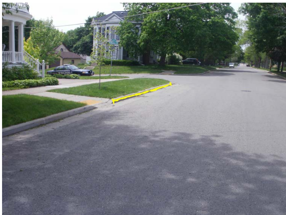
Jackson Street facing West showing area of concern - Yellow line added to photo