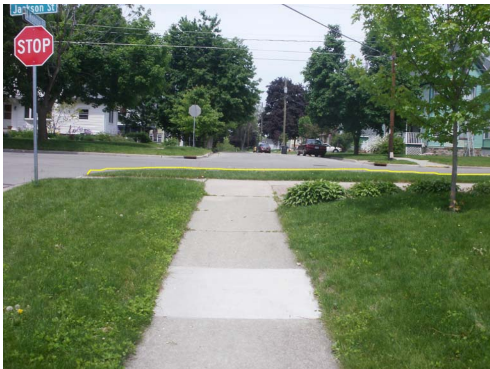
From South of Jackson St looking North, Yellow line at curb is area of concern – added to photo