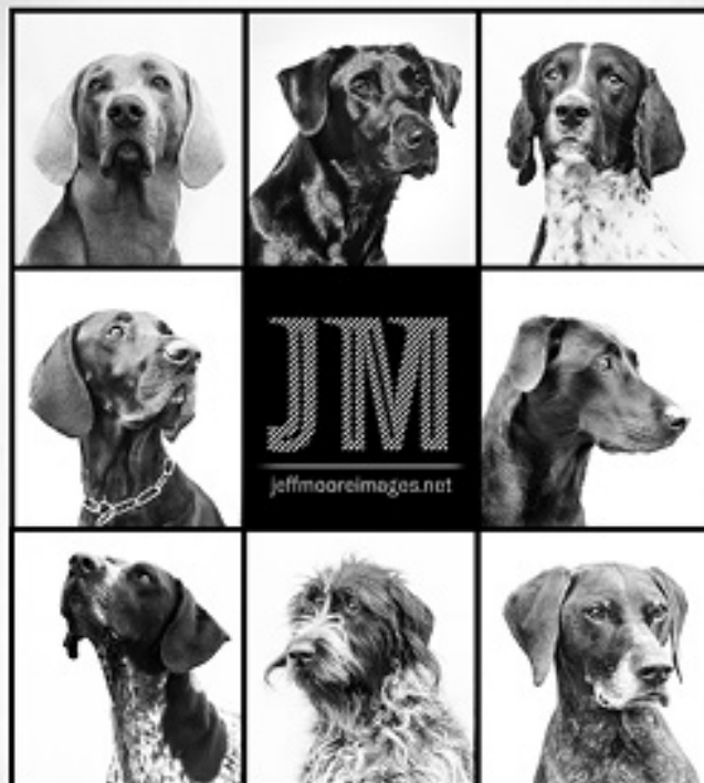
REGAL DOG PORTRAITS. ALL BREEDS. EASY SET UP. AFFORDABLE PRICES. 847-421-5692.