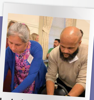
Leadership for Diverse Schools