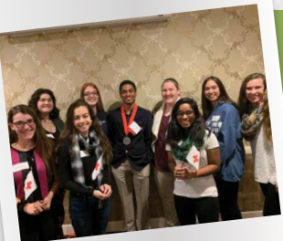
Future Leaders of York