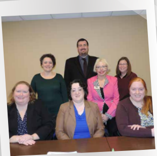
Bar Association Leadership Academy