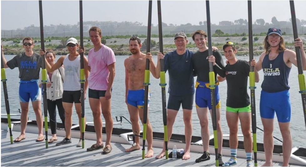
'00 & '10 Alumni Boat