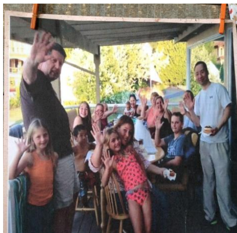
My very large family