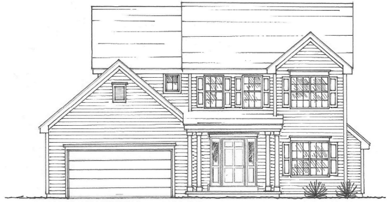
All dimensions are approximate