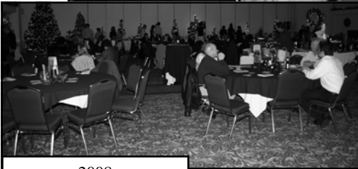
2008 Christmas Tree Festival