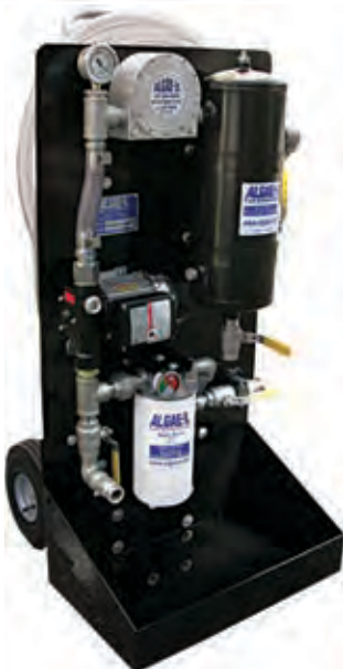
MTC 1000 LX