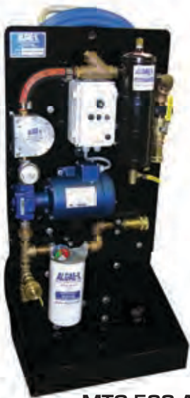
MTC 500 AFR