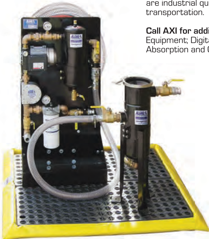
Spill Containment Berm

Call AXI for additional MTC Options : Fuel Sampling & Testing Equipment; Digital Flow Meters; Tank Access Plates; Fuel and Oil Absorption and Cleaning Products, and more.