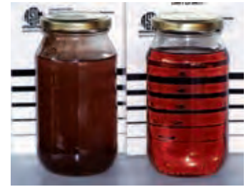
Before and After Fuel Samples from an Installation in Australia