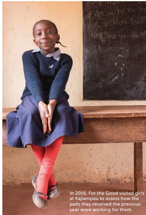
In 2016, For the Good visited girls at Kajimpau to assess how the pads they received the previous year were working for them.