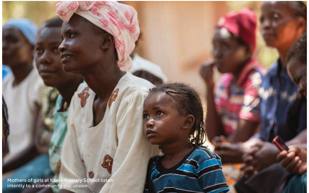
Mothers of girls at Kaare Primary School listen intently to a community discussion.

Bumping along Kenya's rough red dirt roads en route to a school, barefoot children running